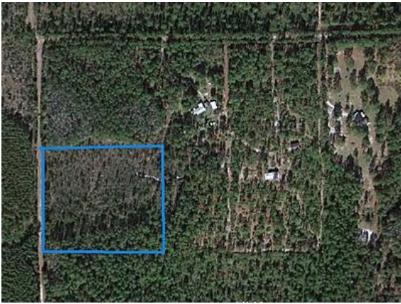
213 Fawn Trail