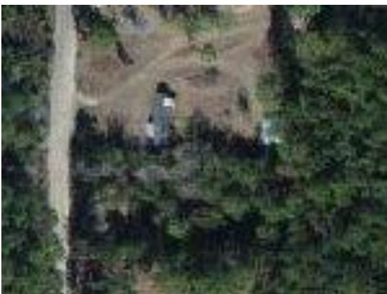
Bardin Estates Cir