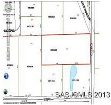
143 Johns Pl